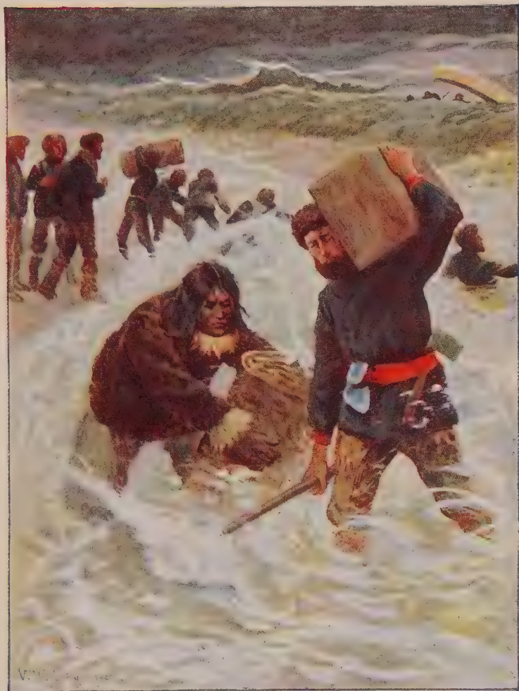
“The men were struggling in the boiling surf to rescue the baggage and provisions.”